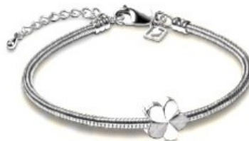
AUNL2040 - Bloom *

Prices range from $286.50 - $432.00 Please note bracelet is sold separately $145.50