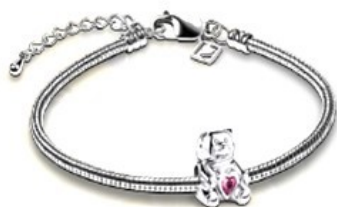
AUNL2080 - Pink Bear