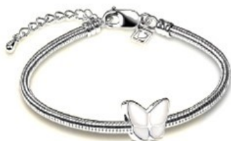
AUNL2092 - Wings of Hope Pearl