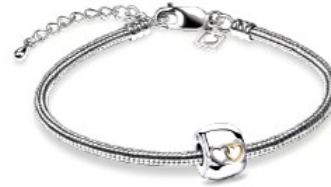
AUNL2014 - Entwined Hearts