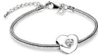
AUNL2003 - Heart to Heart