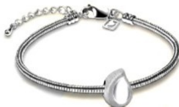
AUNL2060 - Teardrop *