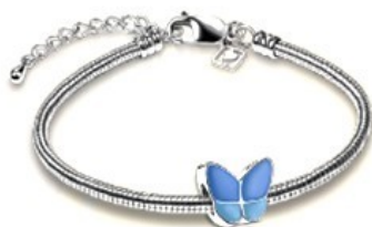
AUNL2091 - Wings of Hope Blue