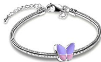
AUNL2090 - Wings of Hope Lavender