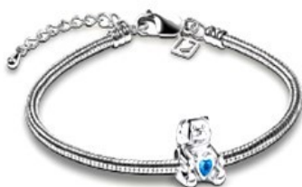
AUNL2081 - Blue Bear