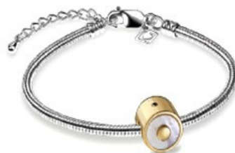
AUNL2122 - Mother of Pearl *

Prices range from $286.50 - $432.00 Please note bracelet is sold separately. $145.50