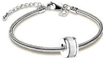
AUNL2010 - Omega *