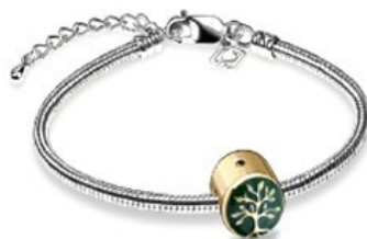
AUNL2121 Tree of Love