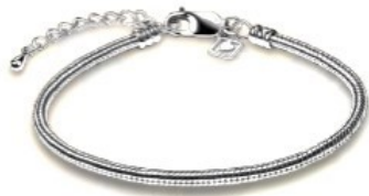
Bracelet is sold separately AUNL2BR - Bracelet