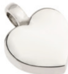
8159S - Plain Heart