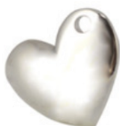
8096 - Heart