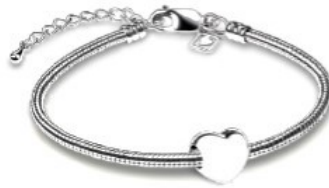
AUNL2000 - LoveHeart *